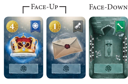
Example of a 2-player Crypt

The first cards drawn are flipped face-up. The last card(s) drawn are kept face-down.