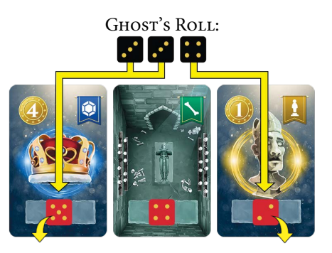
In this example, the Ghost's 3s are joined and push out your 5. The Ghost's 4 cannot push out your 4, so it pushes out your 2.

If a Ghost has the Lights Out card, only place its highest valued die/dice following the same rules.